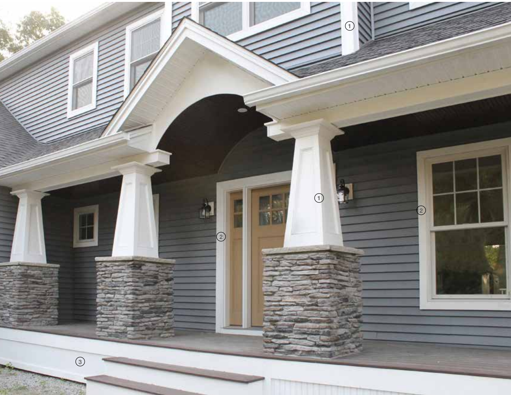
① J-Channel Corner Board ② Window Surround ③ Bead Board