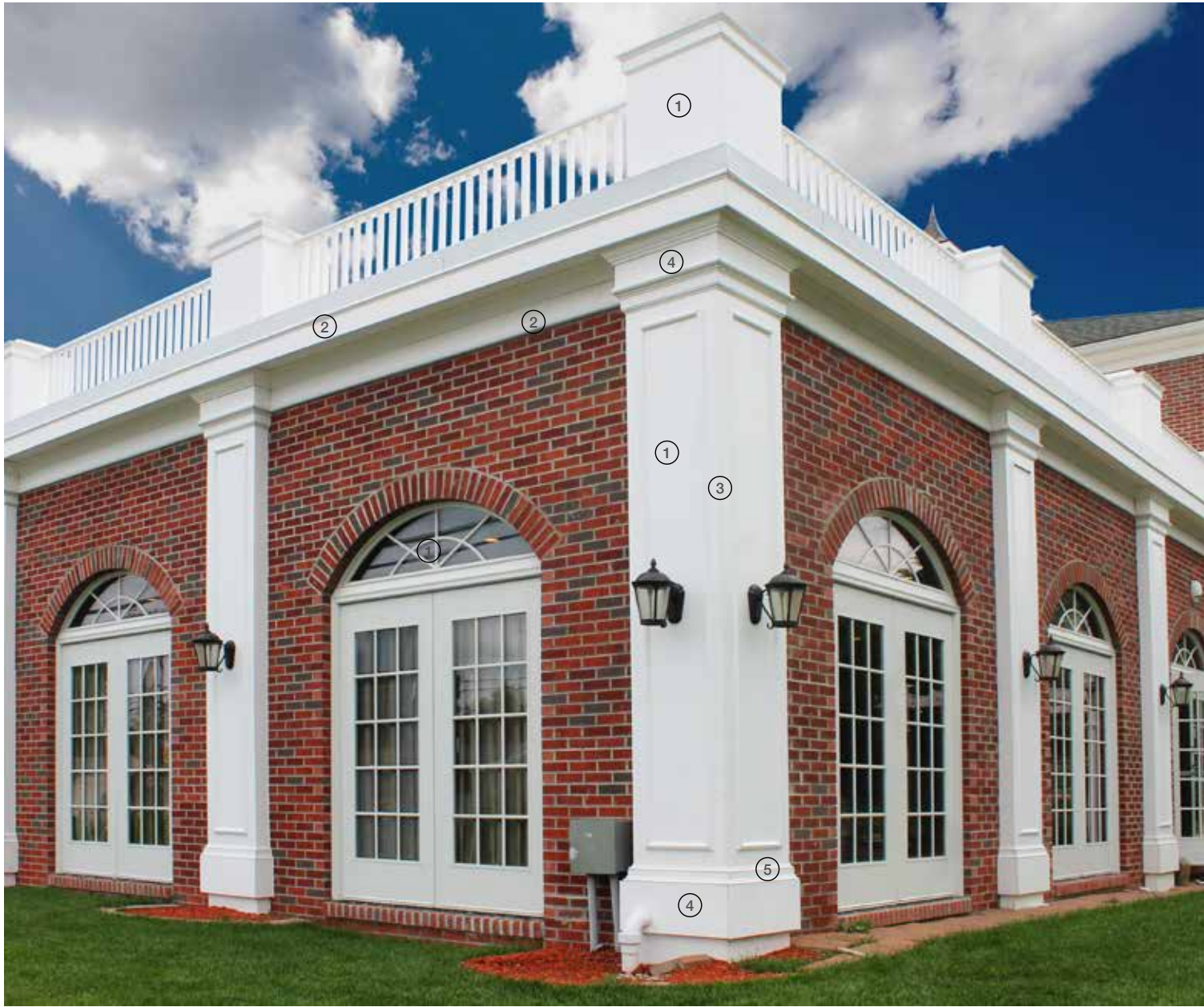
① 3/4" Thick Sheet ② 1/2" Thick Fascia ③ 1"x4" Trim ④ 1"x10" Trim ⑤ 1"x2" Trim